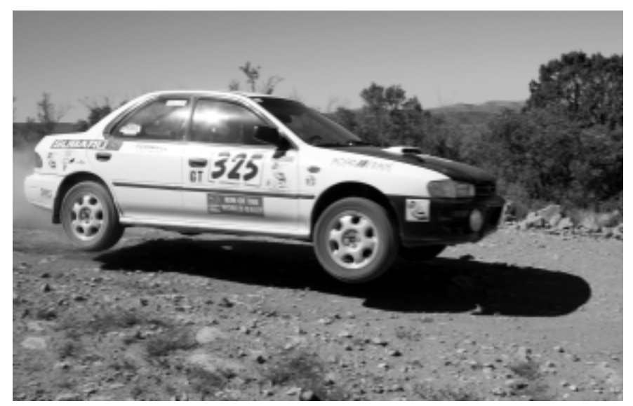
Bruce & Pat Brown - 2004 CRS GT Class Champions

manual will result in forfeiture of inquiy.